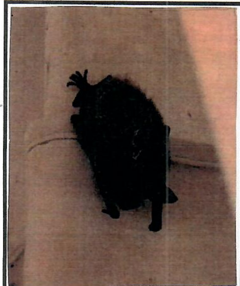
The bizzare bat taking his nap in the umbrella.